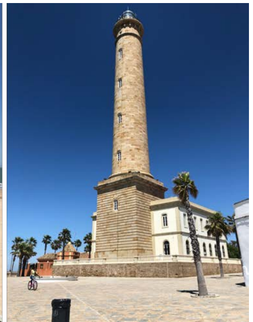
Lighthouse in Chipiona